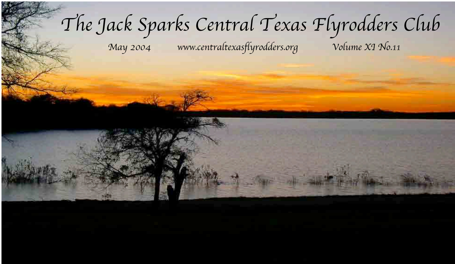
Lake Waco in November Sunset